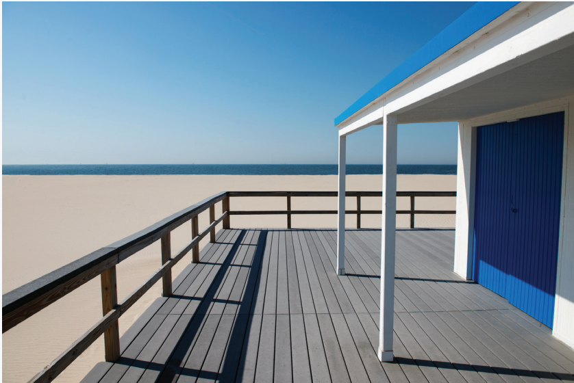
Cabana Blue, Atlantic Beach, NY, 2015