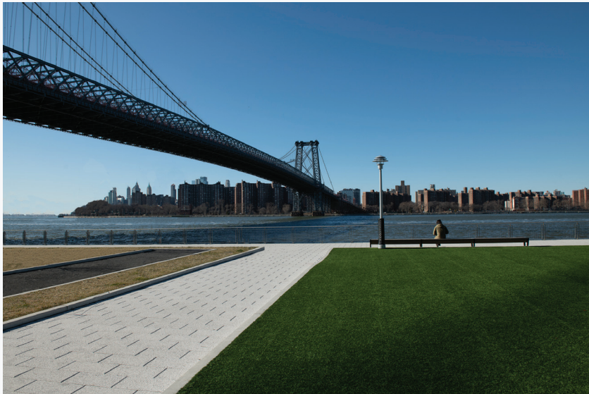
Man and Bridge, Williamsburg, 2020