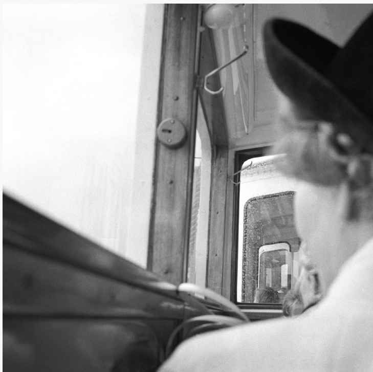
Trolley, Germany, 1970