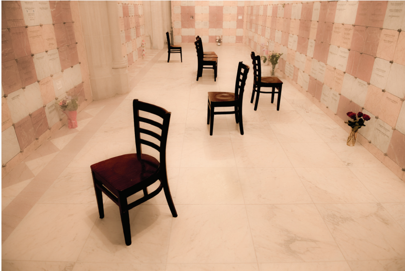
Chairs and Commemorative Roses, St John's Cathedral, New York City, 2019