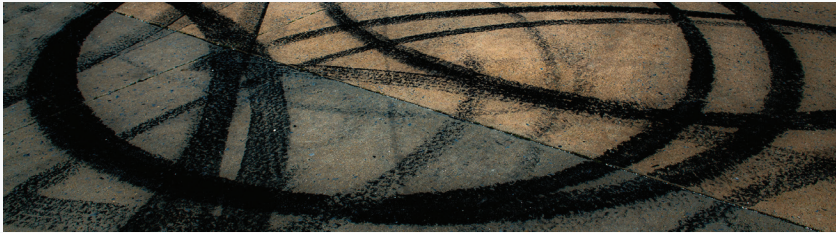
Skids 2, Floyd Bennett Field, Brooklyn, 2018