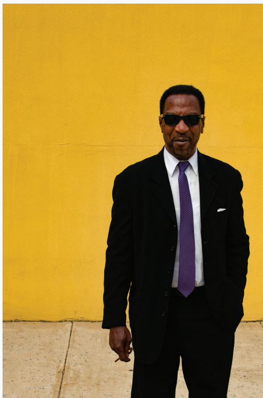
Man With Pocket Square, The Bronx, 2019