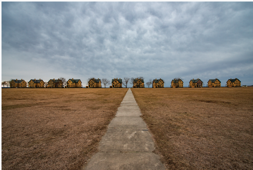
Officers' Row, Fort Hancock, 2018